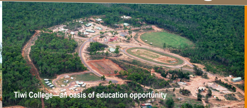
Tiwi College—an oasis of education opportunity

It is with great excitement we hand on management of Tiwi College to the Tiwi Education Board (TEB). Education Transformations and Northern Territory Christian Schools have worked alongside the TEB for the past five years to plan, advocate, design, recruit, train and manage this exciting development in community-driven education. The College now has capacity for 72 students and starts 2010 with a healthy enrolment of Year 7 students. We acknowledge the confidence and